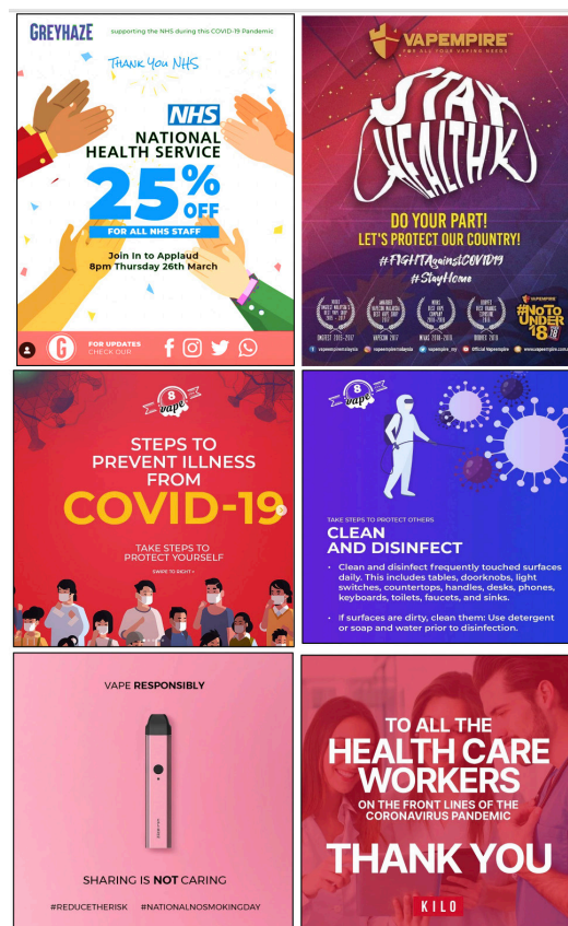
Figure 5 COVID-19 health-themed e-cigarette promotions including offering gratitude discounts for healthcare workers (Greyhaze, Kilo). Others offer sensible precautions relevant to e-cigarette users during a pandemic: 'Clean and Disinfect' and 'Sharing Is not Caring'. The VapeEmpire post displays a 'stay healthy' message in the shape of a surgical face mask. It also appeals to patriotism 'Do your part! Let's protect our country'.

It is more than a bit ironic that e-cigarette companies have chosen to exploit a global pandemic for marketing purposes when their products themselves have been described as causing an epidemic of nicotine addiction among youth. Companies are also using their response to COVID-19 to burnish their public relations. For example, the e-cigarette industry advocacy group Vapor Technology Association ( https://vaporotechnology.org/ ) is making a special effort to collect examples of measures taken by e-cigarette manufacturers in response to COVID-19, no doubt to lobby based on their support for public health 30 (online supplementary figure 7). In another example, Philip Morris International donated 50 ventilators to Greek hospitals. An article on this COVID-19 donation quoted a Greek researcher Constantine Vardavas of the University of Crete as saying: 'it is a funny position to be giving ventilators but selling a product that leads to worse outcomes'. 31 An article in the Los Angeles Times reported that Altria donated $1 million in support of local Richmond,