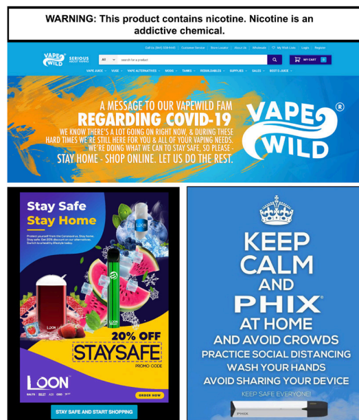
Figure 3 Safety messaging by e-cigarette companies such as Wild Vape's: 'Stay Home – Shop Online. Let Us Do the Rest'. 'The rest' presumably means let us supply you with our vaping products in your own home. Loon uses a 20% discount promo code 'Staysafe' with the implication that using their products are an essential part of remaining safe. PHIX gives a series of safety recommendations including: 'Avoid Sharing Your Device'.

your enthusiasm. You can now call for curbside delivery at our stores'. 19 Twinsmokeshop encouraged people to call ahead and pick up their delivery safely. Stores were also quick to encourage users to order through their online stores. Vintage Vapor asked people to 'Avoid the threat and stay home' by ordering online. 20 IQOS, a leading heated tobacco product offered by Philip Morris International, also promoted free contactless delivery: 'To aide (sic) in minimizing points of contact and support social distancing, we are temporarily waiving ID validation at the time of delivery for online orders'. 18 Waiving age verification may encourage underage use.