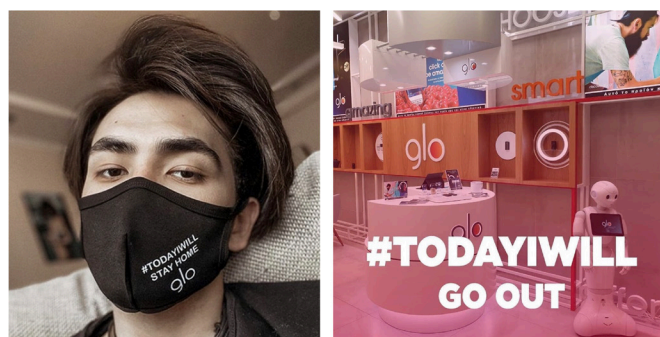
Figure 2 British American Tobacco's (BAT) heated tobacco product Glo-themed facemasks carry the message #todayiwill followed by 'stay home'. The Instagram hashtag #todayiwill has over 15 000 posts, many of which are Glo advertisements. In the same Instagram hashtag BAT messages both today I will 'stay home' and 'go out' with the latter showing a Glo store ( https://www.instagram.com/p/CAzRGij7f9/ ).

With a number of states deeming tobacco stores/vape stores as non-essential businesses, retailers offered 'contactless delivery' and 'curbside' pickup to 'support' their customers during quarantine. 18 Westhartfordartisanvapor told users 'Don't curb